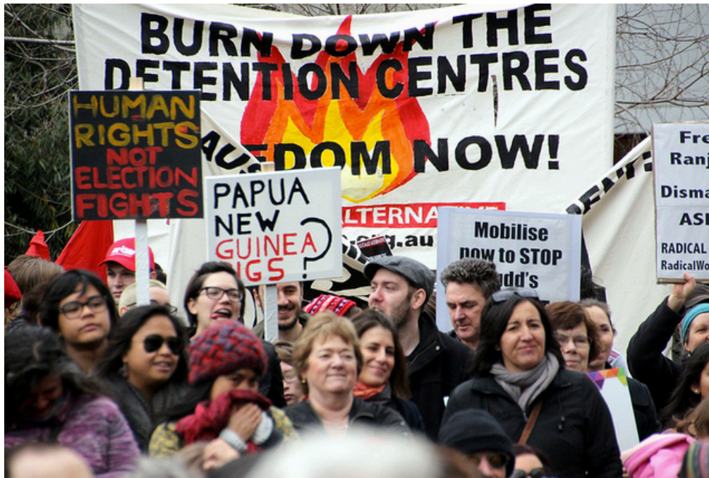
Refugee Action Protest in Melbourne on 27 July 2013.