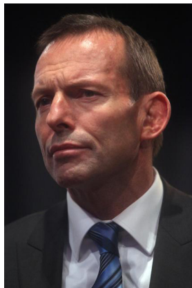
Prime Minister Tony Abbott

“This is a test of wills and Australia has lost. What counts is what the Australian government does, not what it says. It is time for Australia to adopt turning the boats as its core policy.” 1