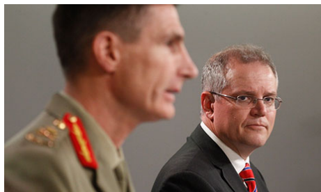
Lieutenant General Angus Campbell and Immigration Minister Scott Morrison at a press briefing.

‘Operation Sovereign Borders’ is the term coined by Tony Abbott in his initiative to restrict immigration into Australia by what has been officially described as a ‘military-led, border security operation supported and assisted by a wide range of federal government agencies’ 7 . Heading the operation is three star Lieutenant General Angus Campbell, reporting to Immigration Minister Scott Morrison.