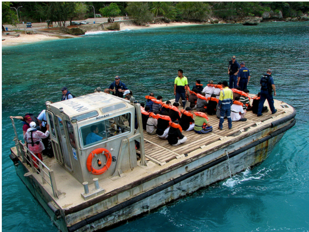
A boat at Christmas Island.

Further, the Australian government has allegedly returned asylum seekers having assessed and rejected their claims at high seas by a videoconference, bringing into question the lack of fair opportunity for an individual to fully present their case 25 . The secret screening and detention processes taking at sea in this regard have further attracted grave concern as to the human rights violations and treatment of the asylum seekers found on the boats. Reports by ABC on 22 January 2014 showed asylum seekers being treated for burns on their hands, which were allegedly caused by being forced to hold a hot exhaust pipe on the boat as punishment for protesting about access to the toilet 26 .