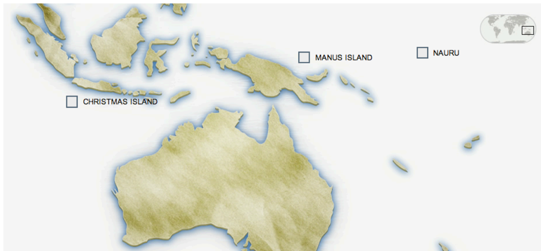
Figure 3: Map of Australia's offshore processing centres

Manus Island houses men who do not arrive with their families, including some unaccompanied boys under the age of 18, many of whom are transferred there from Christmas Island. A study by Amnesty International published in December 2013 found that such removals are carried out with little or no notice and limited explanation. Asylum seekers have reportedly been pressured into signing statements that the transfer is voluntary. Further, the study found that since the Manus Island facility opened in November 2012, no asylum seeker held there had yet received a Refugee Status Determination 14 . The rampant failure of the Australian government to provide effective judicial remedy, along with its arbitrary and indefinite detention process was found by the UN Human Rights Committee in 2013 to amount to “cumulatively inflicting serious psychological harm upon them”. These findings were largely ignored by Australia. 15 The recent violence in Manus Island in 16-18 February 2014 which resulted in the death of one asylum seeker and serious injury of many others highlighted the discomfort faced by those detained for long periods of time; there, it had been almost 18 months since the first transfers to Manus took place with no refugee status determinations or resettlements 16 .