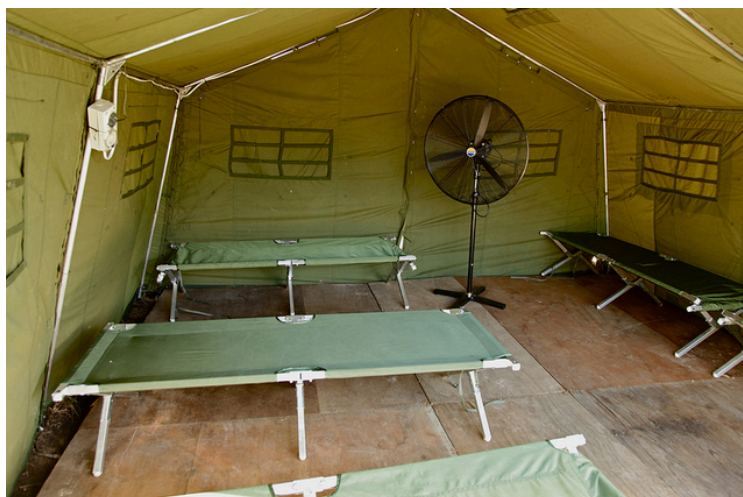
Accommodation at Manus Island.