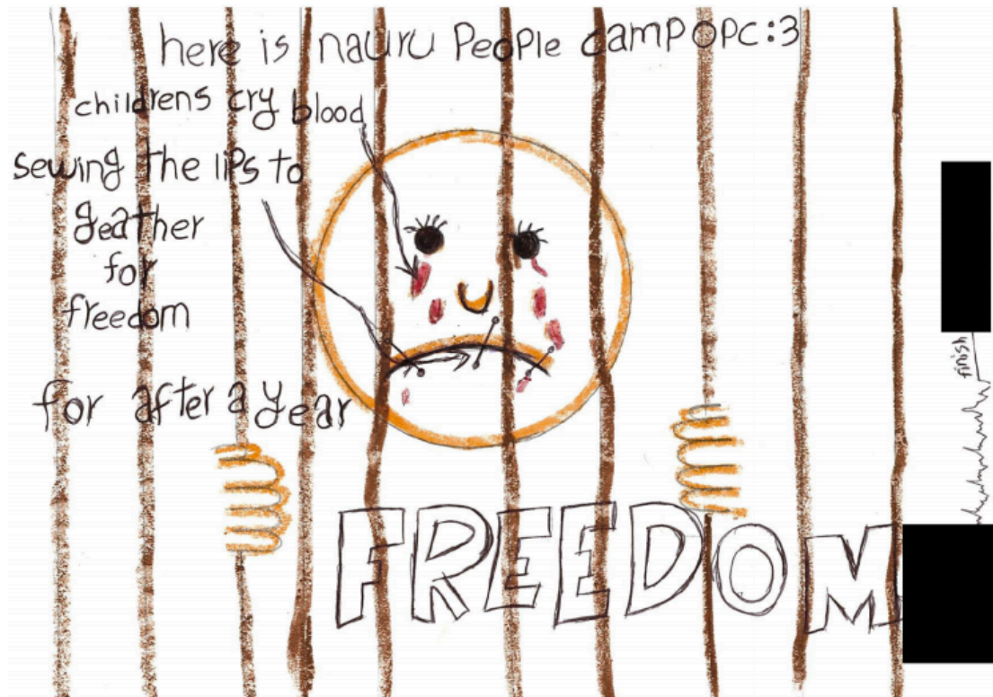
Submission No.194 to the Australian Human Rights Commission's National Inquiry into Children in Immigration Detention 2014 from a child (unnamed) detained in Nauru

A damning example of the uninhabitable conditions at Nauru Island was seen in reports of three pregnant asylum seekers who had been transferred to offshore detention on Nauru requesting abortions, citing conditions in detention and the longevity of the time held there as reasons. 42