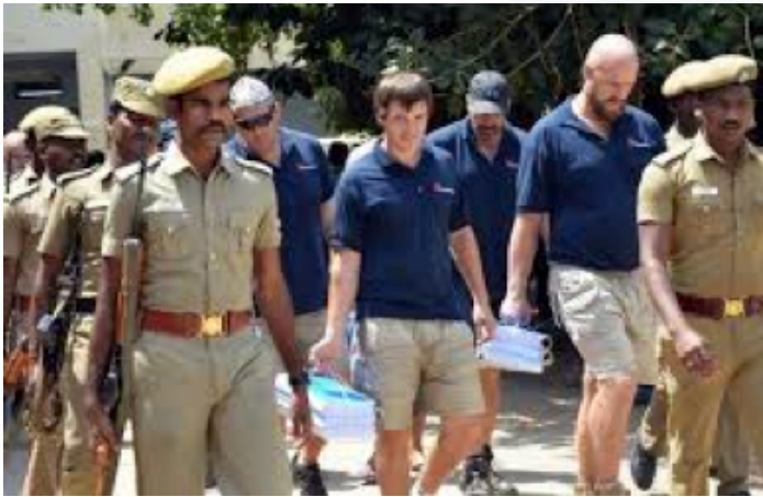
Crew served with court order