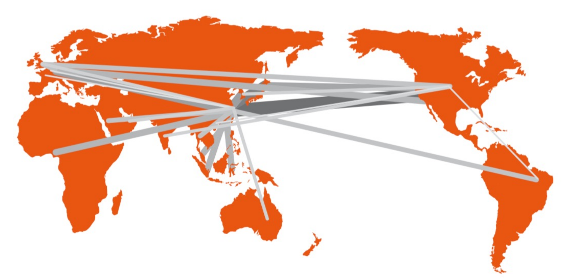
Diagram from Global Marine Trends 2030