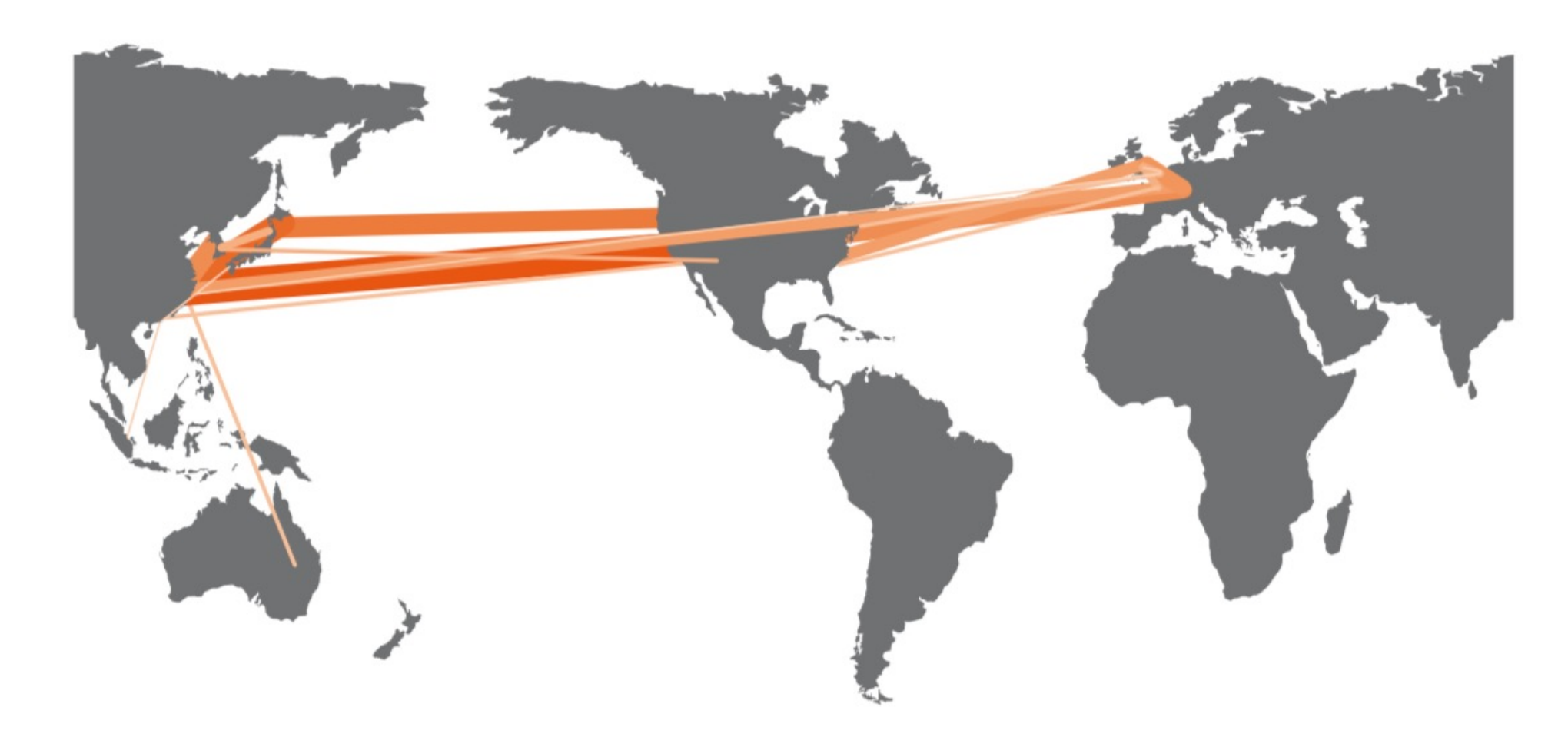
Fig. 2 Top sea bilateral trade in 2030 (Sino centric)