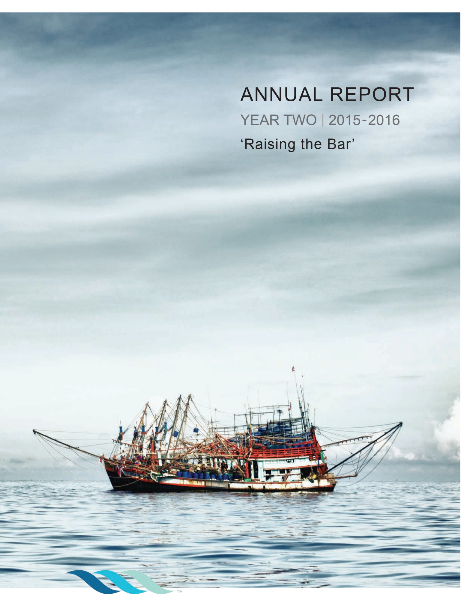
HUMAN RIGHTS AT SEA